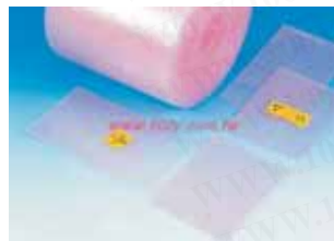
Anti-static Bubble Bags