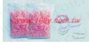
Anti-Static Rubber Band