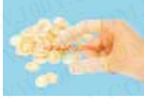
BTL213 Anti-Static Finger Cot-L Anti-Static Finger Cot-M