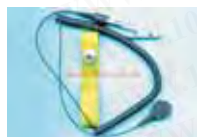
4674 Green 3M