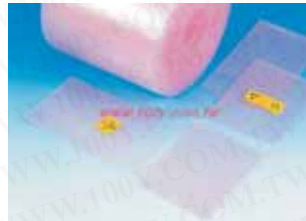
RSB-105 / 17*27 RSB-105 / 17*32