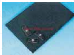
18*18*5 18*9*5 180*125*10mm 1M*1M*3.5mm 1M*1M*8mm