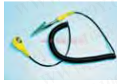
Ground Cord -Black cord with yellow end