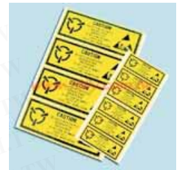
Anti-Static Labels 130*50 Anti-Static Labels 65*25