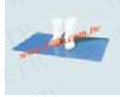
ES-30123 ES-30127 ES-30129