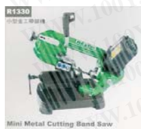
Mini Metal Cutting Band Saw