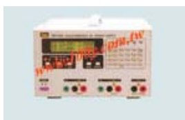
"ABM" apheliotropic LCD Power Supply