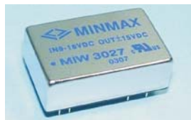
MIW3000 Series Dual Outputs