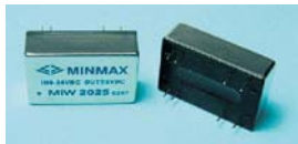
MIW2000 Series Dual Outputs