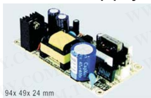
94x 49x 24 mm

Detailed product specifications are available on: us.100y.com.tw