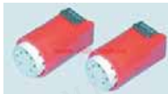
Midget Groove LED

Detailed product specifications are available on: us.100y.com.tw