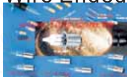
3mm Wire Ended Neon Lamp

Detailed product specifications are available on: us.100y.com.tw