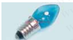
E101. 5V-12V, P13. 5S 1. 5V-12V