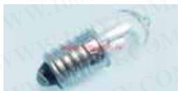
6VE10 E101. 5V-12V, P13. 5S 1. 5V-12V