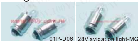
01P-D06 Midget Groove Lamp

Detailed product specifications are available on: us.100y.com.tw