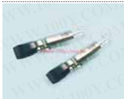
Telephone Slide Lamp T 5.5