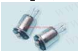
Flange Base Lamp

Detailed product specifications are available on: us.100y.com.tw