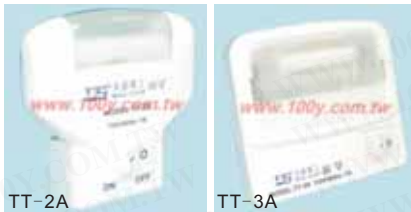
Night Light Family

Detailed product specifications are available on: us.100y.com.tw