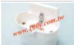
Lampholders and Brackets