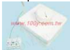
DIM adjustable knob switch

Detailed product specifications are available on: us.100y.com.tw