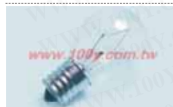
Tungsten GLS Lamp