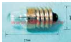
13244 : Length : 9mmx21mm