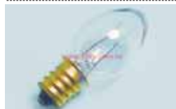
Acuate clear bulb