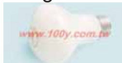
Tungsten GLS Lamp

Detailed product specifications are available on: us.100y.com.tw