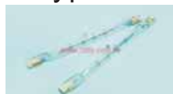
Twin Head Quartz Halogen Lamp

Detailed product specifications are available on: us.100y.com.tw