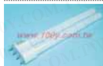
"PHILIPS" PL Lamp