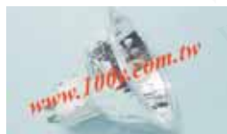
GE_EDISON MR16 Halogen