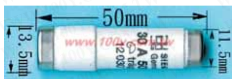
NDZ-E16-16A NDZ-E16-20A NDZ-E16-25A NDZ-E16-30A