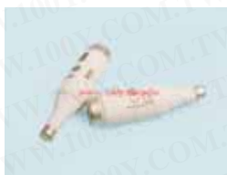
NDZ-E16-10A NDZ-E16-2A NDZ-E16-4A NDZ-E16-6A