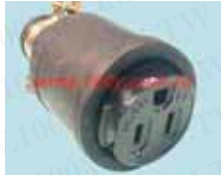
H Type Plugs 15A