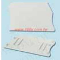
Rail mount terminal end cover

Detailed product specifications are available on: us.100y.com.tw