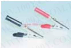
Alligator clip with large molded handle