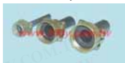
Cable Strain Relief Clamp

Detailed product specifications are available on: us.100y.com.tw