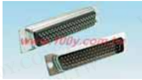
HDSP78SB4A1 180° 'D' Sub-miniature Solder Cup Connectors (4 Rows /78Pins )

Detailed product specifications are available on: us.100y.com.tw