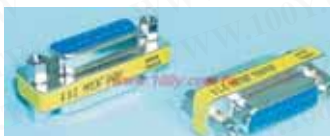
MGC-15FF Mini DB15-15-Pin Adaptor