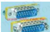
MGC-15MM Mini 2 Row 15-15-Pin Adaptor