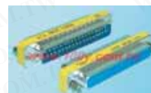
MGC-37FF Mini 37-37-Pin Adaptor