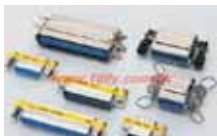
MGC-15MF Mini 2 Row 15-15-Pin Adaptor