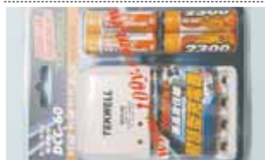
DCC-60 Rechargeable Ni-MH/Ni-CD