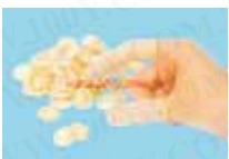
BTL213 Anti-Static Finger Cot-L Anti-Static Finger Cot-M