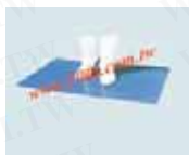
ES-30123 ES-30127 ES-30129