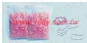
Anti-Static Rubber Band