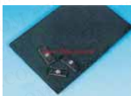
18*18*5 18*9*5 180*125*10mm 1M*1M*3.5mm 1M*1M*8mm