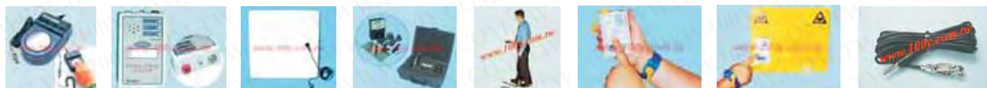
HAKKO 498 MK-8401 MK-8404 Ts701 19252 WRST-1T WRST-1T-A HAKKO 498-1

3M™ Test Kit for Static Control Surfaces 701, Certified!