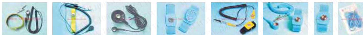
4614 4674 Green 3M MK-8430 Pc000000000 RSB-111 RSB-112 RSB-112 WRS-E